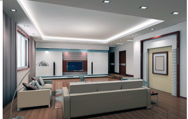
All Dimensions in "mm"