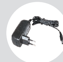
Charger Adapter NLB100120W1U INPUT:100-240V~50/60Hz OUTPUT:12V 1000mA