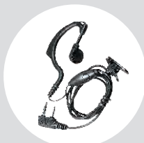
Ear-piece Mic EHK01