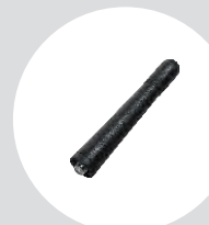
Antenna (UHF) H350B(350-390MHz) H350B(400-470MHz)