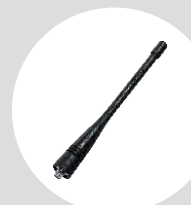
Antenna (VHF) H350B: (136~174MHz)