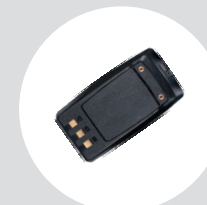
Li-ion Battery BL2601 Battery Capacity: 2600mAh