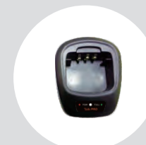
Charger CL0701 Charge Current: 700mAh