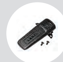
Belt Clip S03 Flexible Washer